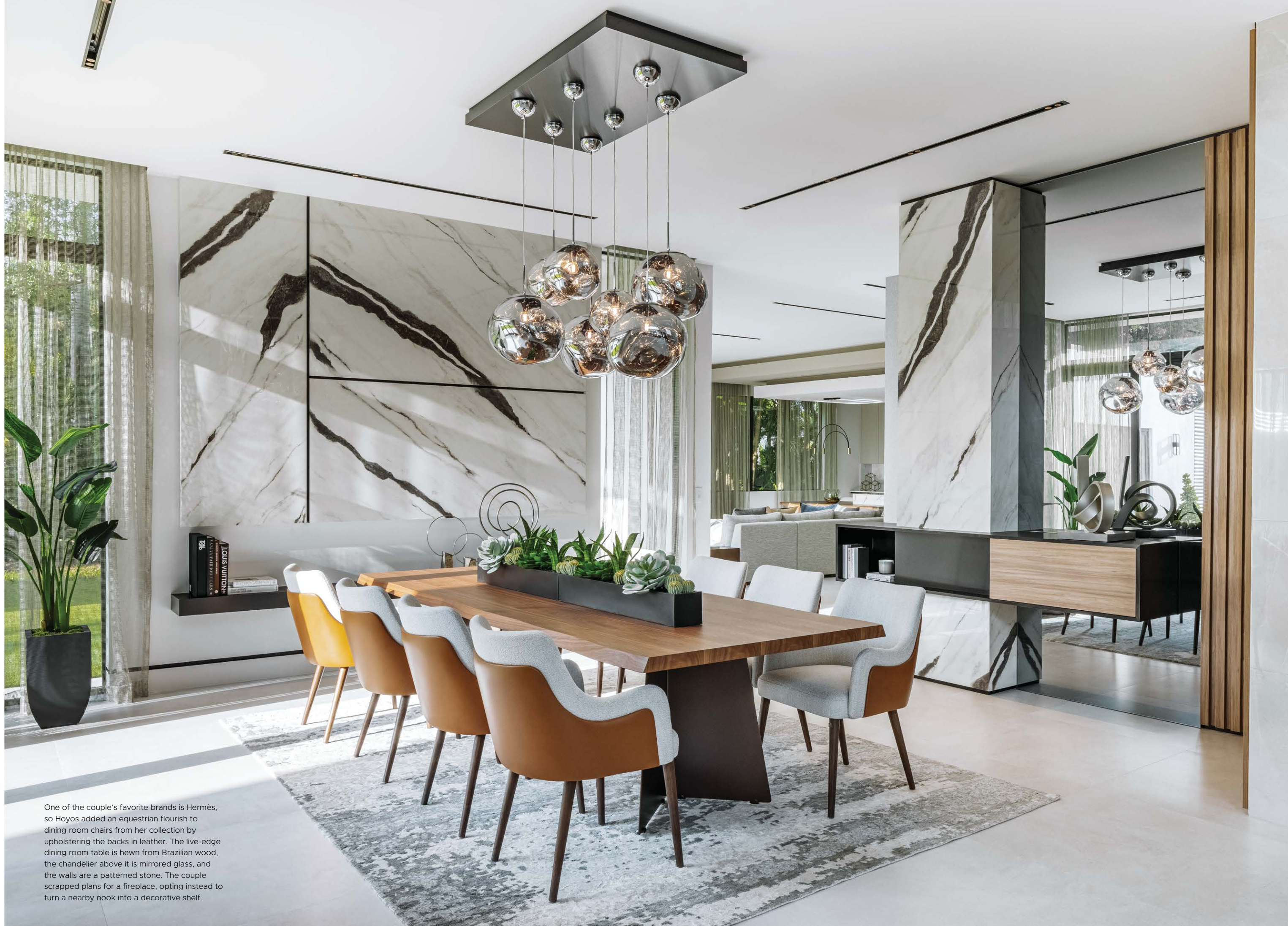
One of the couple's favorite brands is Hermès, so Hoyos added an equestrian flourish to dining room chairs from her collection by upholstering the backs in leather. The live-edge dining room table is hewn from Brazilian wood, the chandelier above it is mirrored glass, and the walls are a patterned stone. The couple scrapped plans for a fireplace, opting instead to turn a nearby nook into a decorative shelf.

"I hate creating museums," she says. "I've worked