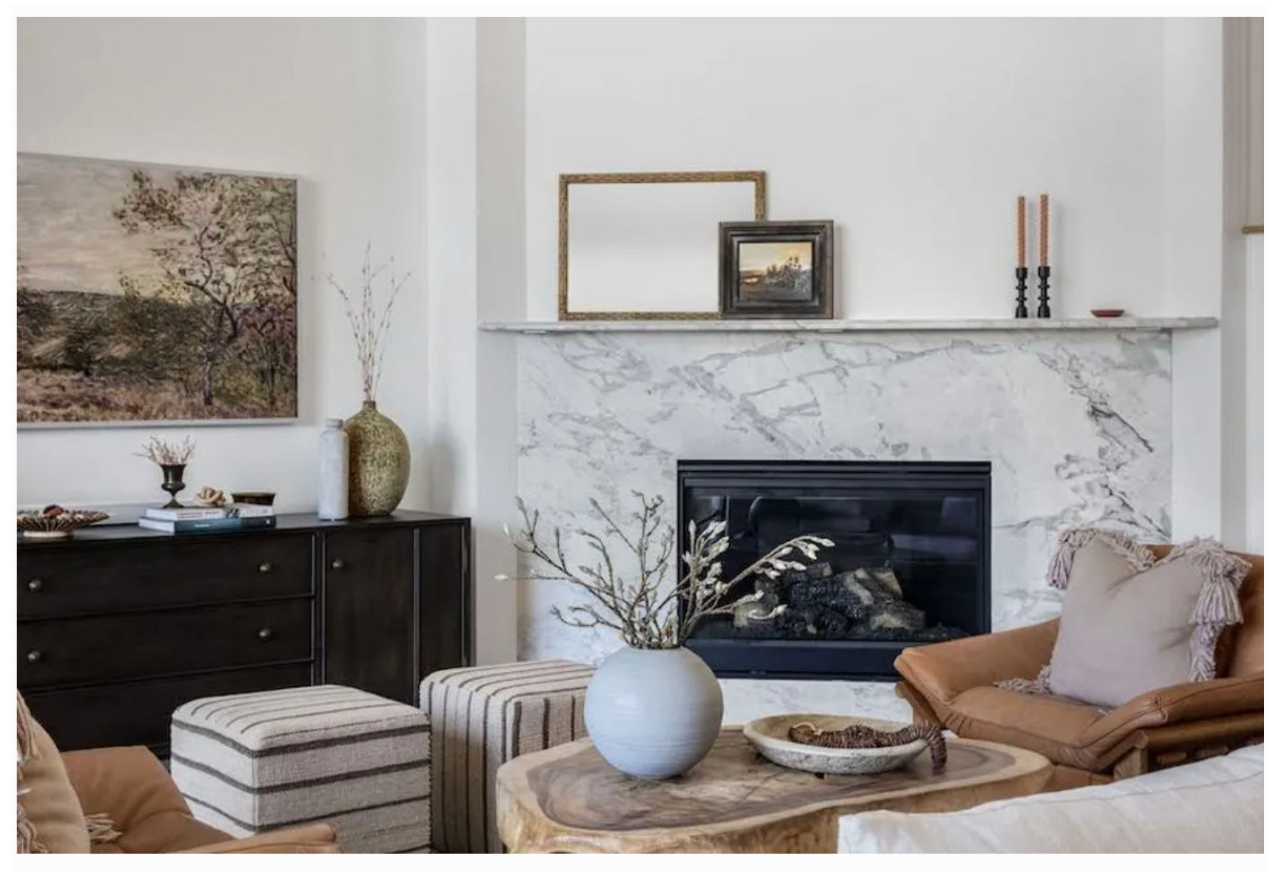
A contemporary living room designed by Audrey Scheck

Not traditional yet far from modern, contemporary interior design can feel like the best of all words. Audrey Scheck of Audrey Scheck Design tells me, "While modern design refers to a specific time period, contemporary design is a more loose term designating both current and future design trends. Contemporary design evolves as interior design trends come and go."