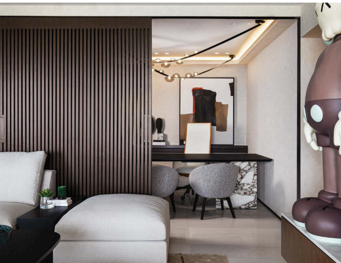
LEFT: FRAMED BY A FLUTED WOOD SCREEN LENDING ARCHITECTURAL INTEREST, THE HOME OFFICE OFFERS A TRANQUIL AND FUNCTIONAL WORKSPACE, BLENDING SOPHISTICATION WITH COMFORT. A CHIC DESK FROM ROVE CONCEPTS PAIRS WITH A POLTRONA FRANU DESK CHAIR, OFFERING BOTH ELEGANCE AND ERGONOMIC SUPPORT. TWO HINOTTI CHAIRS COMPLETE THE SEATING ARRANGEMENT, CREATING A BALANCED AND INVITING ENVIRONMENT.