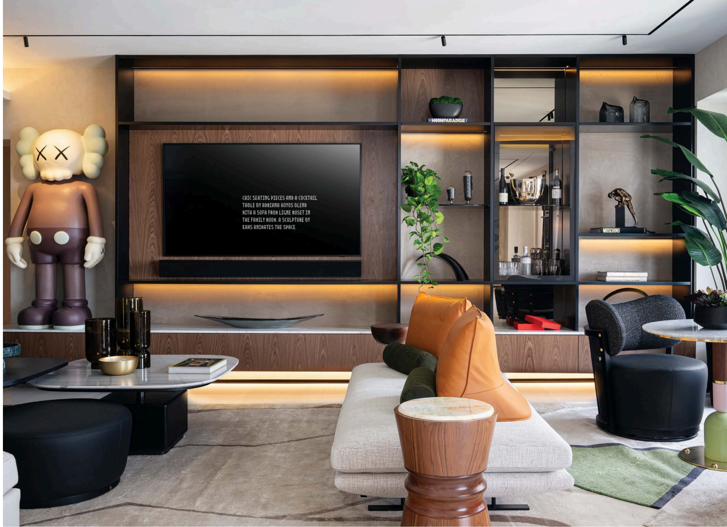
CHIC SEATING PIECES AND A COCKTAIL TABLE BY ADRIANA HOYOS BLEND WITH A SOFA FROM LIGNE ROSET IN THE FAMILY ROOM. A SCULPTURE BY KANS ANIMATES THE SPACE.

such as built-in cabinetry and ceiling treatments, were custom-designed to befit the aesthetic flawlessly. Standout features, including custom millwork and bespoke details, introduce warmth and personality, while floor-to-ceiling windows flood the space with natural light, displaying exceptional views of the Miami skyline, Biscayne Bay, and the Atlantic Ocean. "The result is a cohesive, timeless home that reflects the homeowners' lifestyle while embracing the natural beauty of its surroundings," says Hoyos. Upon entering the apartment, one is welcomed into a seamless flow of spaces where every detail has been thoughtfully curated. Custom pieces by Adriana Hoyos Design Studio mingle with dynamic lighting fixtures and eye-catching works of art in nearly every space. Throughout the home, skillfully selected materials—rich woods, finely crafted millwork, and architectural enhancements—reflect a unified and classic aesthetic, blending comfort with sophistication. Each room balances textures, tones, and architectural elements to generate a luxurious and inviting space.