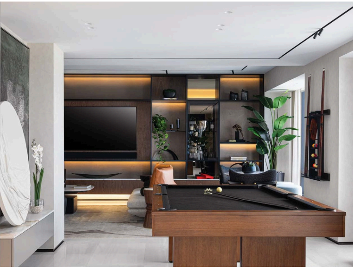
ABOVE: AN INVITING GAME ROOM AREA FORMS AN AIN'T INTERLUDE BETWEEN THE KITCHEN AND FAMILY ROOM, WITH A BILLIARDS TABLE FROM CRATE & BARREL GRABBING THE SPOTLIGHT. ON THE OPPOSITE SIDE, A SLEEK HALL NICHE HOLDS AN ETHEREAL WHITE SCULPTURAL PIECE, PROVIDING DRAMATIC CONTRAST AGAINST THE DARK WOOD ACCENTS.